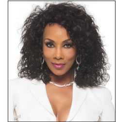
Vivica A. Fox Actress, Producer, Director, Philanthropist