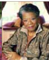
Dr. Maya Angelou