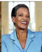
DR. JOHNETTA COLE, Executive Director, Smithsonian African American Museum