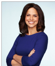
Soledad O'Brien, Journalist and Anchor, CNN's Starting Point