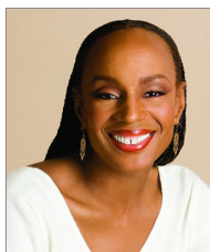
Susan Taylor, Founder, National CARES Mentoring Movement; Essence Magazine Editor-in-Chief Emerita