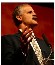
Stedman Graham, Best Selling Author, Educator, and Entrepreneur