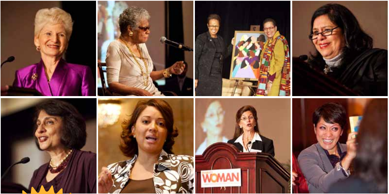
PHOTOS OF PARTICIPANTS AT LAST YEAR'S CONFERENCE