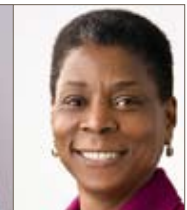
Ursula Burn, CEO XEROX