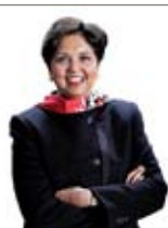
Indra Nooyi, CEO, Pepsico