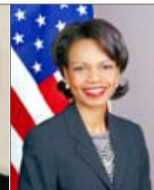
Condoleezza Rice, Former Secretary of State