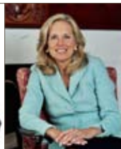
Dr. Jill Biden, White House Second Lady