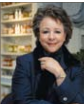
Sheila Johnson, Co-Founder of BET